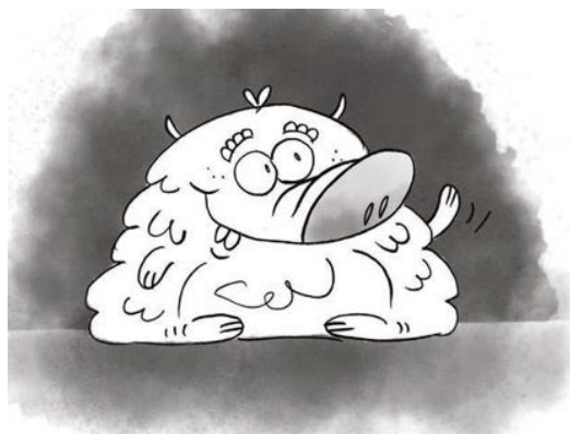
Illustration of creature from page 6 of extract