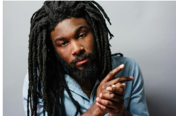
Patrice Lawrence and Jason Reynolds